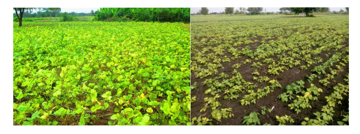
Plate 3: Field view of MYMV disease incidence in different locations